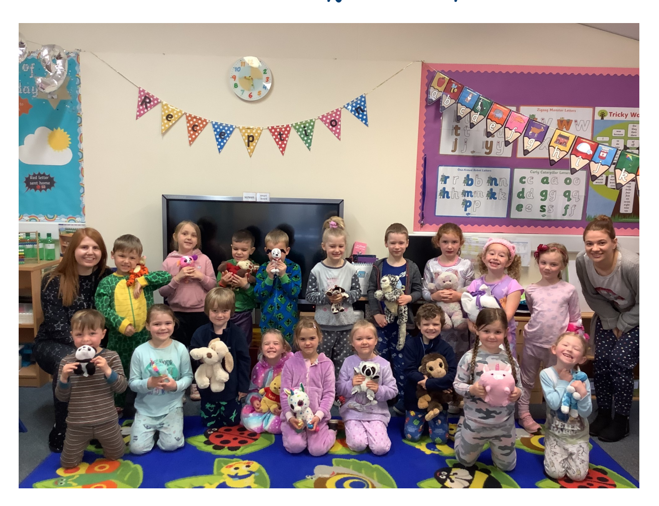
Chestnut Class—Pyjamarama Day