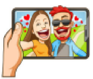
A Parent's Guide to Sharing Pictures