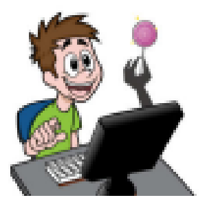
A Parent's Guide to Online Grooming